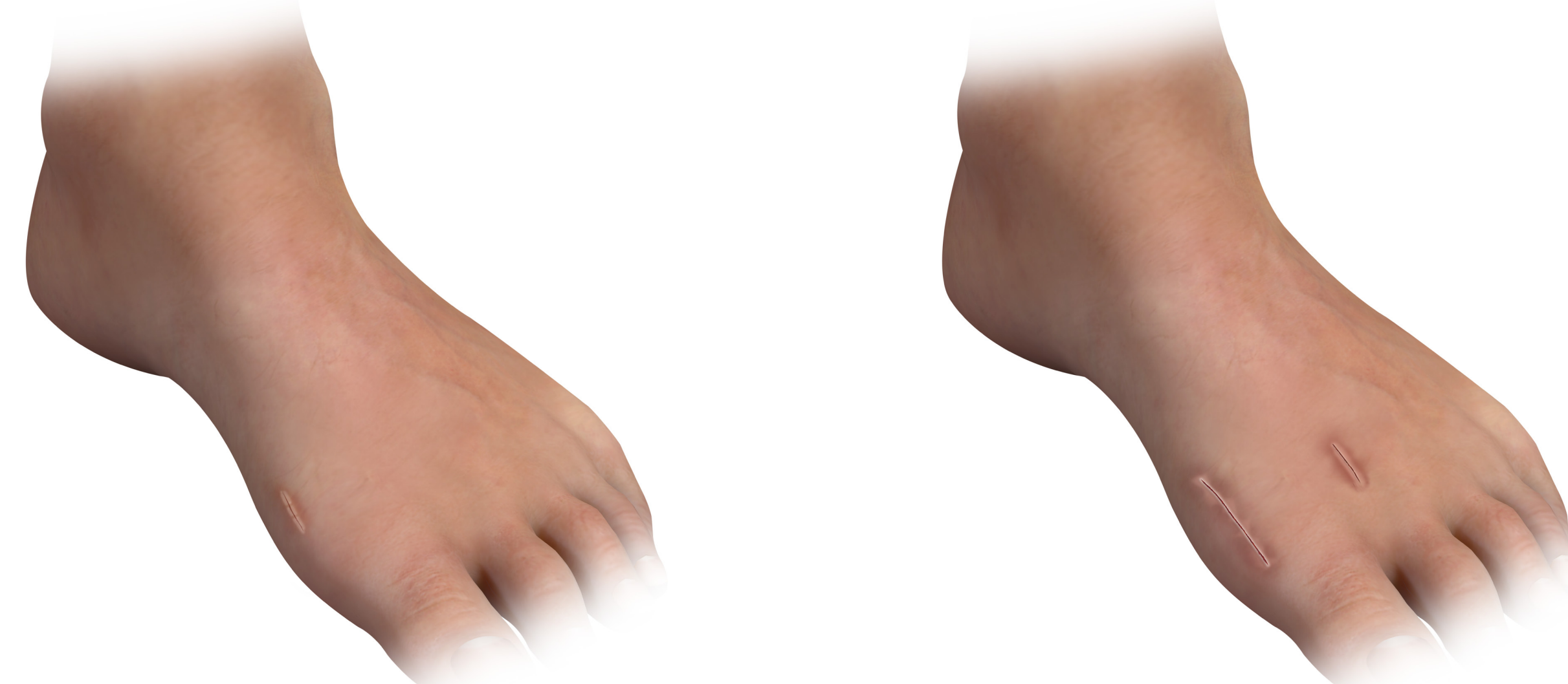
Nanoplasty ® 3D MIS Bunion Correction ™ Surgery

Nanoplasty ® 3D MIS Bunion Correction ™ is a cutting-edge, minimally invasive surgical procedure to correct your bunion through a hidden incision on the side of your foot.